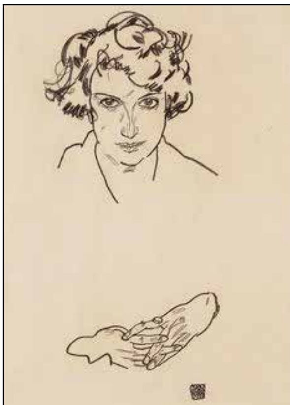
Portrait of a Girl, 1917, black crayon on wove paper. Egon Schiele

Should you get a hankering to draw, Austin is full of opportunities. There are classes at the Art School at Laguna Gloria, The Dougherty Arts Center, and Austin Community College just to name a few.