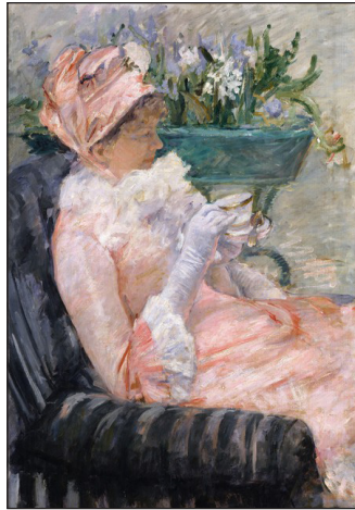
A Cup of Tea by Mary Cassatt 1891 (dry point and aquatint)

A Cup of Tea is on loan to the McNay from the Metropolitan Museum of Art in New York City. Cassatt often painted everyday life and made teatime the subject of a series of works painted around 1880. Her sister posed for this canvas, as she often did for Cassatt. Look for Impressionist characteristics in the brightness of the woman's gloved hand and the teacup and spoon. Notice the scurried brushwork in the background and the gorgeous use of gray