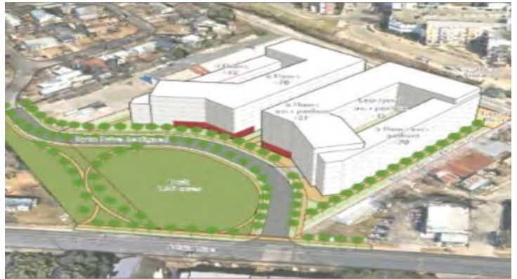
Sample development scenarios for the Ryan Drive property from the City of Austin Economic Development Department Request for Proposal packet

Whew. It pretty much does. The RFP specifies: housing with at least 50% affordable units, at least 1.25 acres of park/open space, 7K sq. ft. of community/creative/local retail